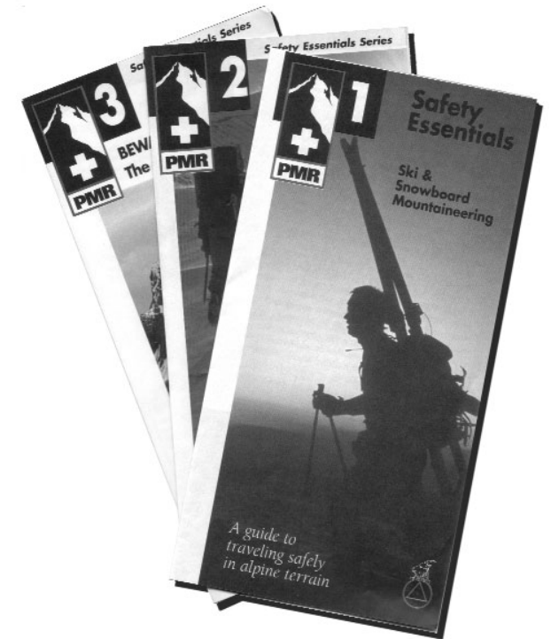
The Safety Essentials Series Educational Brochures are produced by Portland Mountain Rescue as a service to climbers.