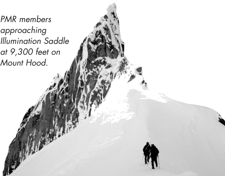
PMR members approaching Illumination Saddle at 9,300 feet on Mount Hood.

Portland Mountain Rescue carries out its important mission without paid staff or government funding. All PMR members are volunteers who give generously of their time and energy out of concern for their fellow climbers. While PMR operates under the authority of local sheriffs' departments, it is funded entirely by donations from recreational groups, businesses, and concerned citizens. PMR does not charge for its services.